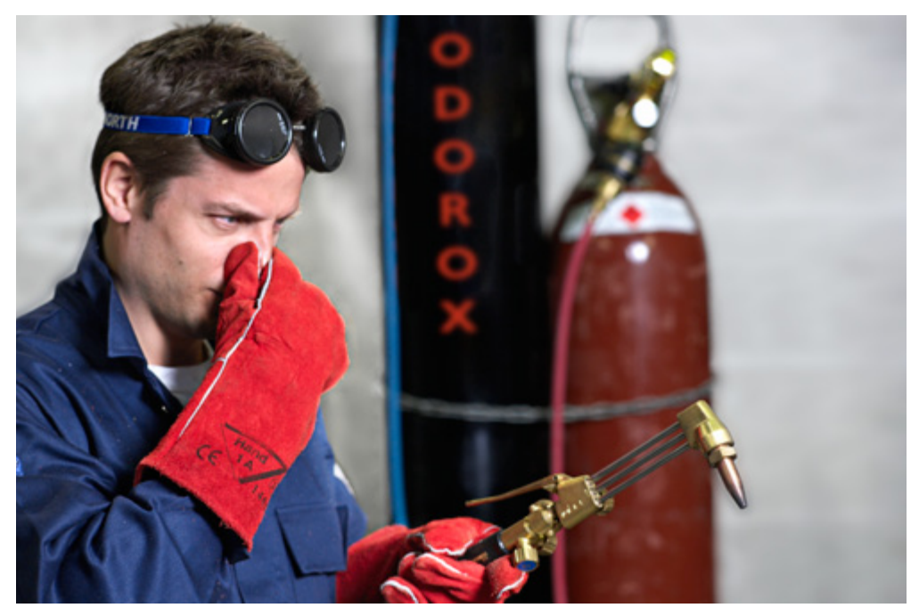
ODOROX® odorized oxygen has a clearly detectable odour to warn of potential leaks and dangerous accumulations of oxygen. With the help of your nose, the ODOROX® gas contributes to a safer working environment.

ODOROX® odorized oxygen from AGA is an early warning system that is designed for all oxy-fuel applications to safeguard the working environment. It reduces the very real risk of fire or explosion by providing a distinct warning odour when oxygen concentrations rise unintentionally above normal level. Since AGA is able to supply the gas in cylinders and supply lines, all industrial users of oxy-fuel applications have access to the enhanced safety of the ODOROX® concept.