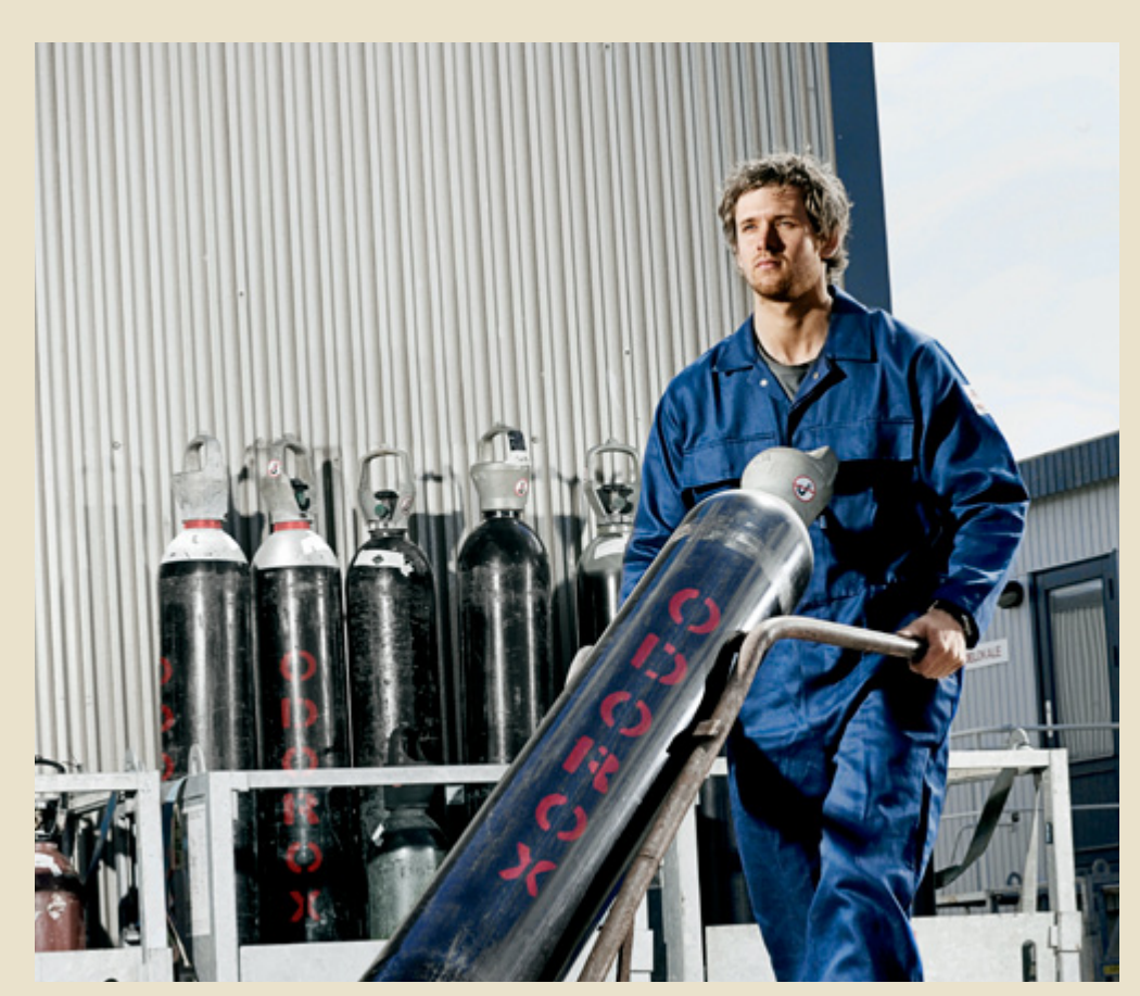
ODOROX® odorized oxygen for an unmistakable warning of unwanted concentrations of oxygen. Available in cylinders, in cylinder bundles, and for large-scale customers with supply lines. An increase to 24 % from the ambient oxygen concentration of 21 % doubles the Combustion velocity. By the time this figure reaches 40 %, the combustion velocity in contact with a spark or naked flame increases tenfold. ODOROX® odorized oxygen is intended to enhance safety at the workplace but should not be considered a substitute for standard safe practice.

concentration rises from 21 % to 22 %. Even when only 10 parts per million (ppm) of DMS have been added to the oxygen, the smell becomes noticeable in plenty of time to take protective action. The small quantity of DMS in oxygen has no impact on the performance of the oxy-fuel process nor on the working environment.