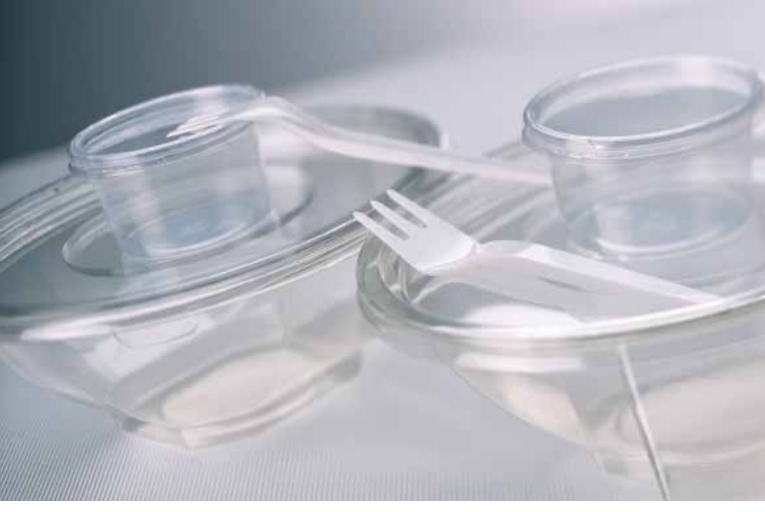
Various packaging materials