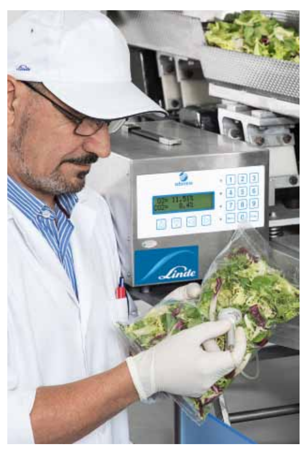
Packaging of salad with flow-pack machine